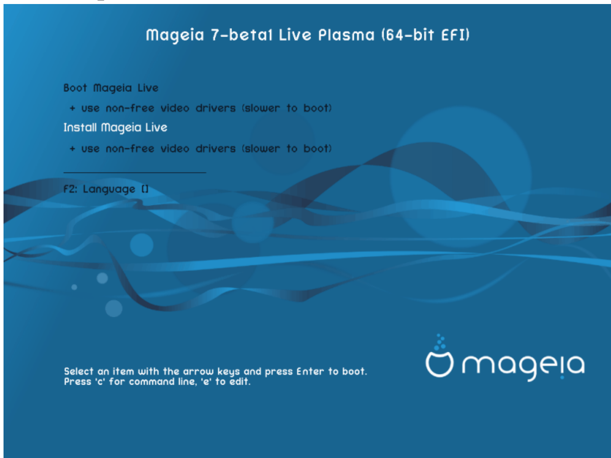
First screen while booting in UEFI mode