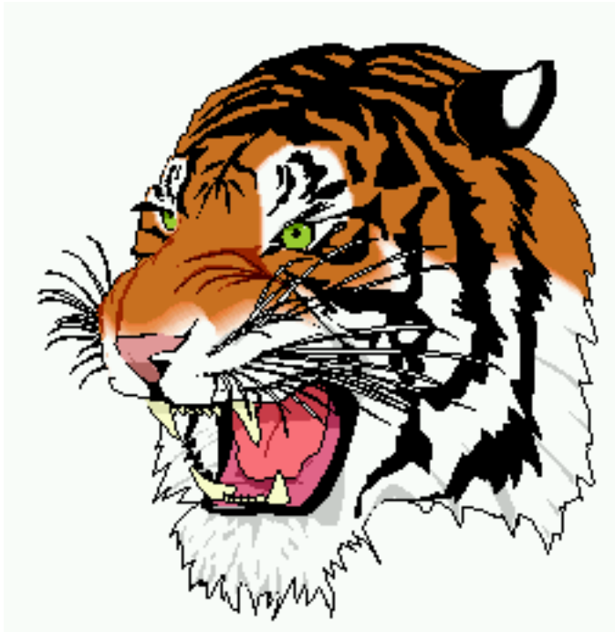
Figure 1. Tiger block image