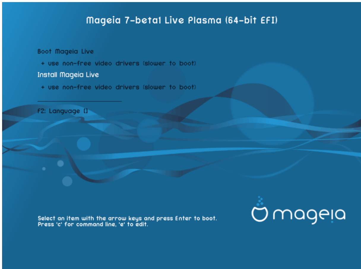
First screen while booting in UEFI mode